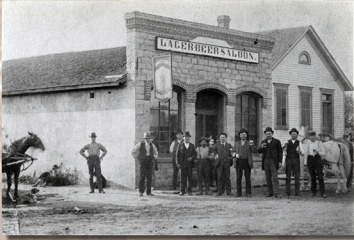
1. Lager Beer Saloon 1860s