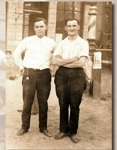
5. This building once also housed a barber shop