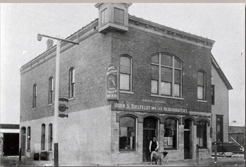
3. George V. Groh Tavern circa 1911 - note the second story on the house