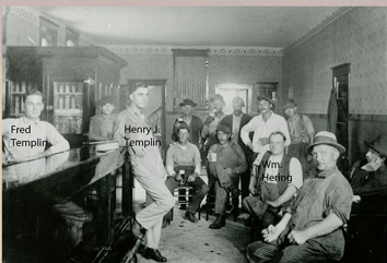
4. H. Templin's Interior