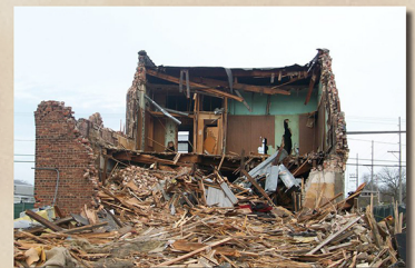
8. Tavern demo April 2010